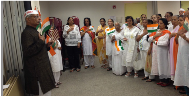
Indian Independence Day celebration planned by our seniors