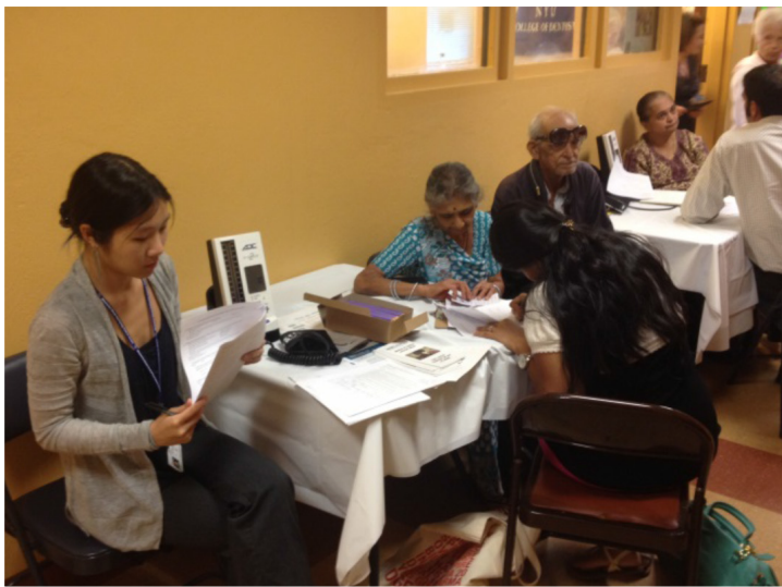
Health fair organized with SAHI